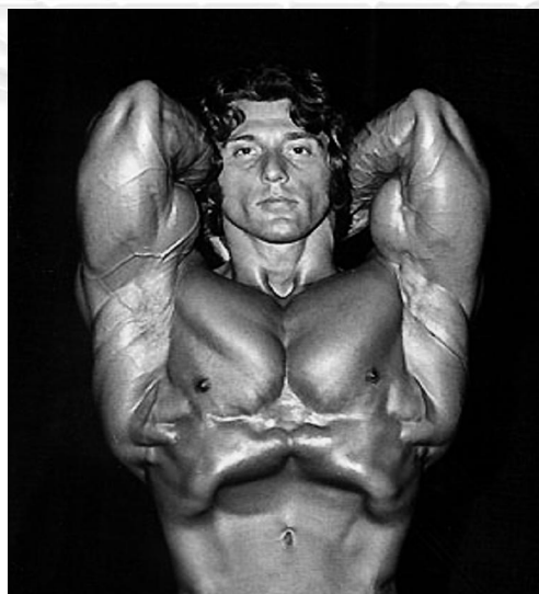
The Abdominal Vacuum Pose; one of many great poses made famous by Frank Zane.

Where the physique is concerned, there couldn't have been much difference between the two.